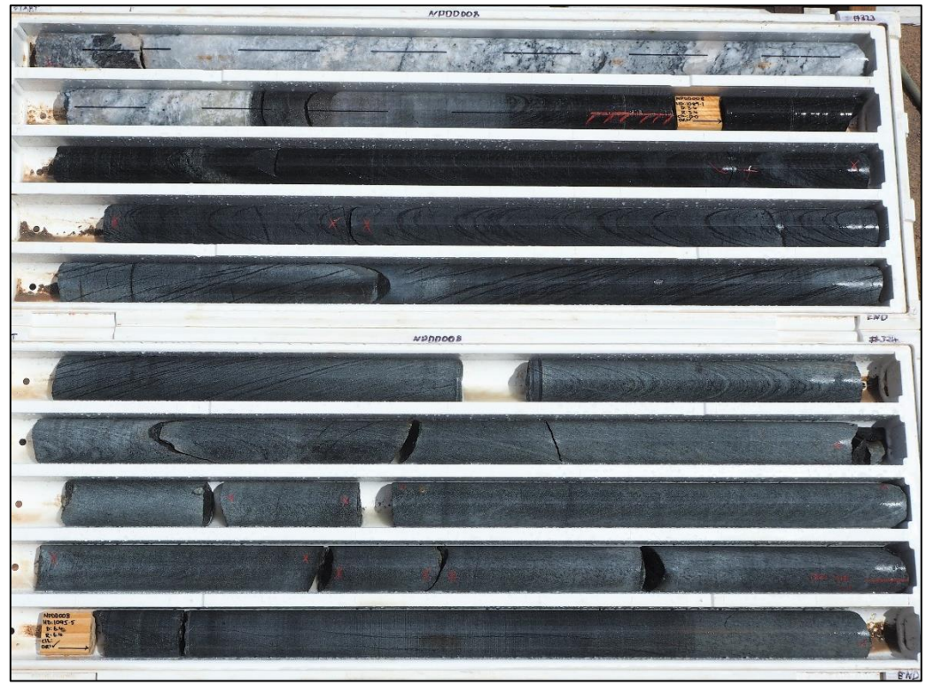
Photograph 1 – NPDD008: upper section of the first of the prospective komatiitic ultramafics (orthocumulates) intersected <u>below</u> the thick pegmatite intrusion (from 1088.5m)

This announcement has been authorised by the Board of Directors of the Company.