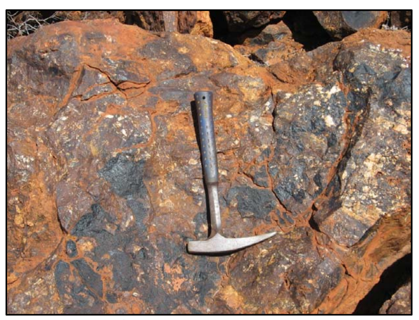
Figure 3 Intense silica/iron alteration in breccia outcrop adjacent to the B23 VTEM target