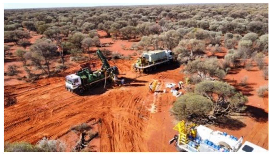
Figure 3 Drilling at Jubilee Well.