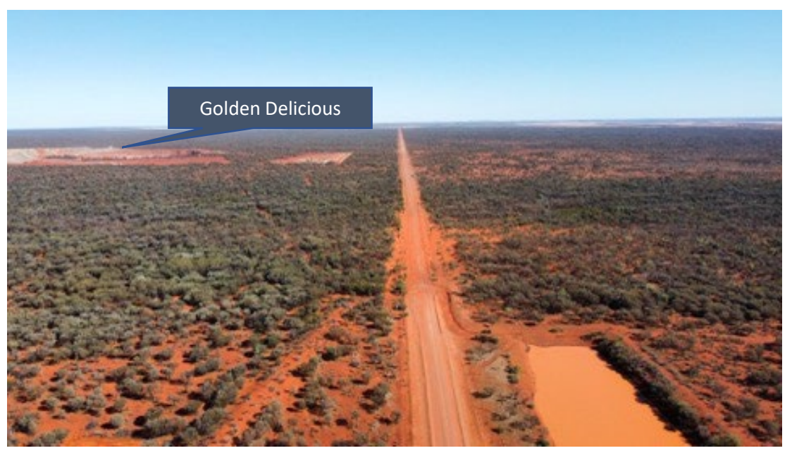
Figure 2 View looking south.

Samples from the program will be dispatched and assayed for gold and multi-elements.