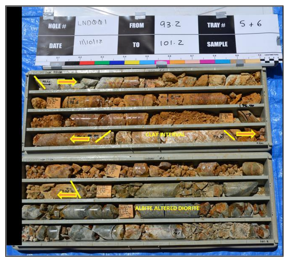
Figure 2 Brecciated and strongly ferruginous (brown) quartz vein system located on the contact between felsic schist and diorite. Vein interval is shown by the yellow arrows.