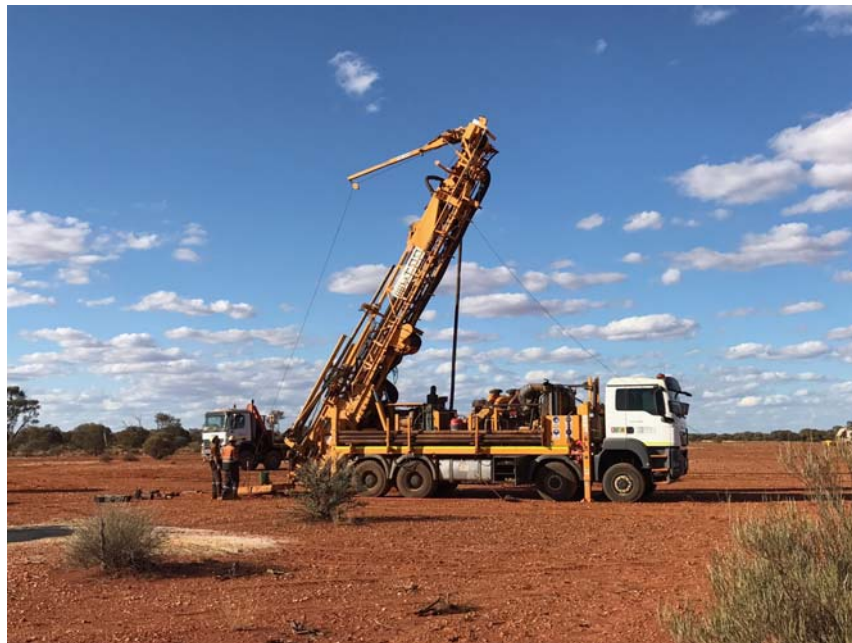
Figure 1: Diamond drill rig at the Ned's Creek project.

The first of two planned diamond drill holes at Contessa was started during the weekend and drilling is expected to take close to two weeks to complete. The drilling is being co-funded by the WA Government's Exploration Incentive Scheme.