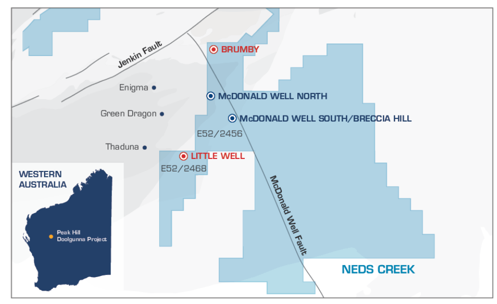
Figure 1 Location of the Brumby prospect, Neds Creek, Peak Hill-Doolgunna Project

Lodestar Minerals Limited (ASX Code: LSR, the Company) is pleased to announce significant results from follow-up sampling at the Brumby Prospect on Neds Creek tenement E52/2456, within the Company's Peak-Hill Doolgunna Project in Western Australia. Lodestar released the results from initial rock sampling earlier in November of up to 5.8 g/t gold (see Lodestar's ASX release dated 16th November 2012), that identified the Brumby prospect as a new gold discovery.