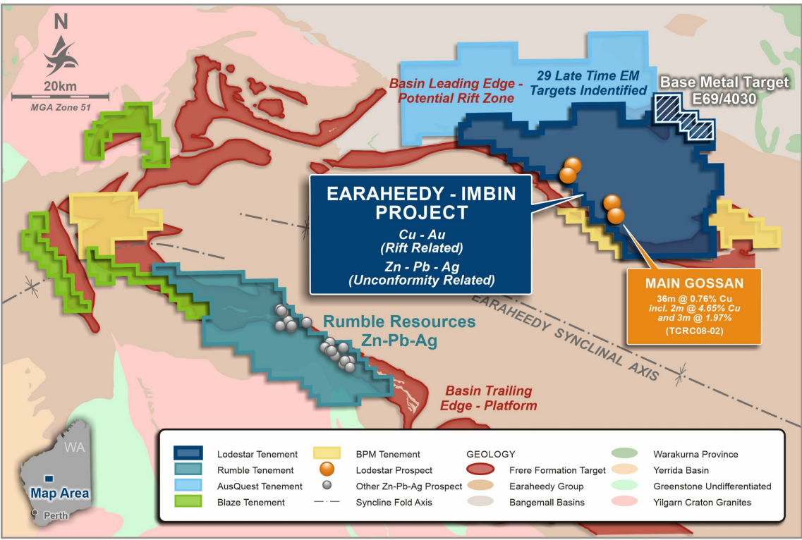
Figure 1 Location plan showing tenement application E69/4030.

Lodestar Minerals Limited ("Lodestar" or "the Company") (ASX:LSR) advises that it has recently applied for an additional exploration tenement on the Company's 100%-owned Earaheedy-Imbin project northeast of Wiluna, Western Australia (see Figure 1).