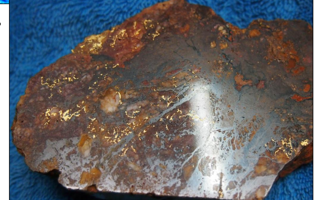
Figure 3 Visible gold in polished specimens of laterite duricrust, Marymia E52/2734. These samples were collected as specimens, have not been submitted for assay and no attempt was made to estimate the gold content.