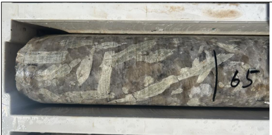
Image 1: KHDD001 showing of coarse spodumene in drill core at 64.9-65.1m down hole depth (pale green elongated phenocrysts) – awaiting assays

Metallurgy and mineralogy will form part of FBM's on going technical studies into the lithium mineralisation at the KHLP.